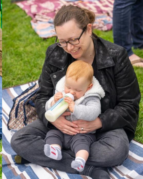
Hellman's Hollow Picnic